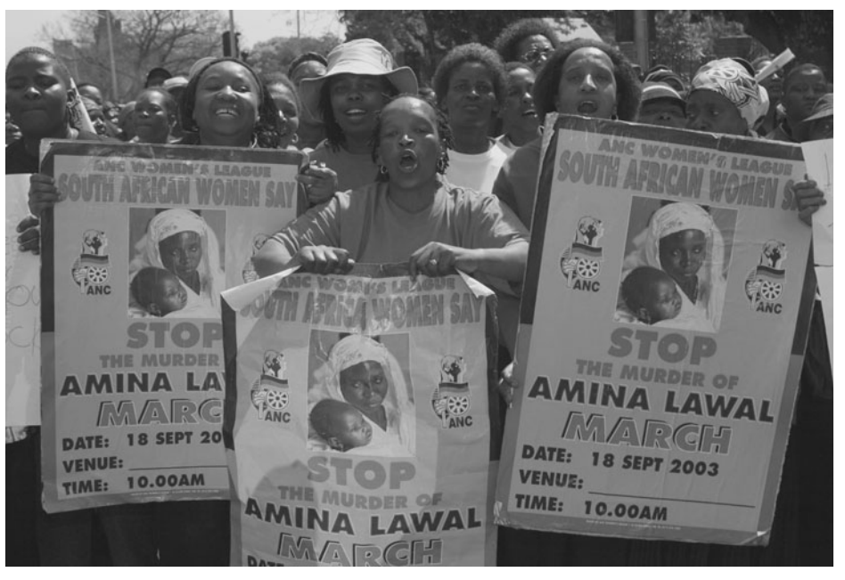
17. Women protest against the death sentence of the Nigerian Amina Lawal, 2003.