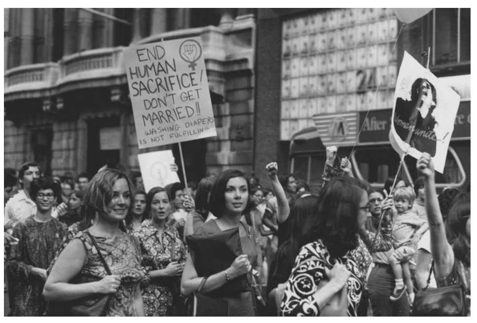
15. As this banner suggests, the early movement, in America as in Britain, quickly learned to make its arguments dramatically and wittily.