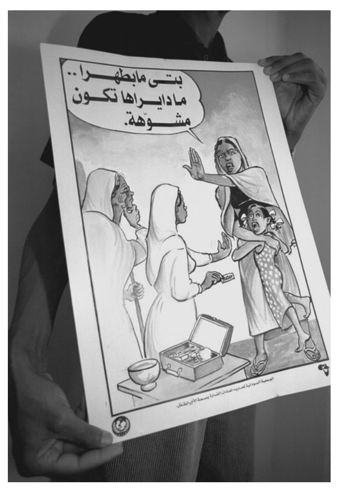
16. Anti-female circumcision poster, Sudan.