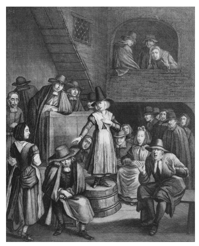
1. The scene is viewed with a hint of satire – though is it directed at the earnest speaker or at the inattentive audience? One is actually sleeping, others demonstrate disapproval.

against . . . the spirit of the Lord speaking in a woman, simply by reason of her sex . . . speak against Christ and his Church, and are of the Seed of the Serpent.'