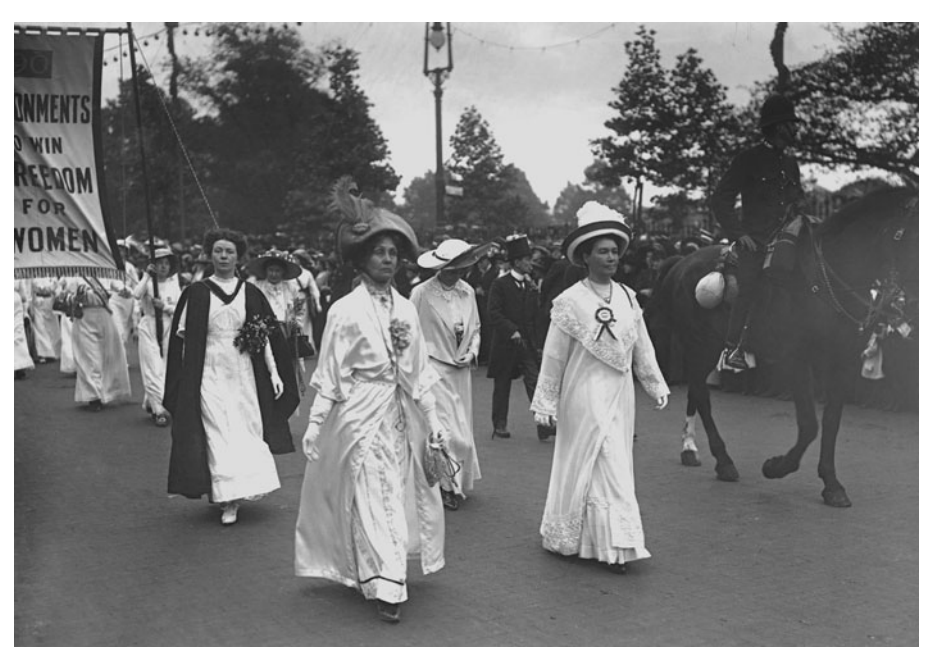
6. Suffragette demonstration, led by the Pankhursts, 1911.