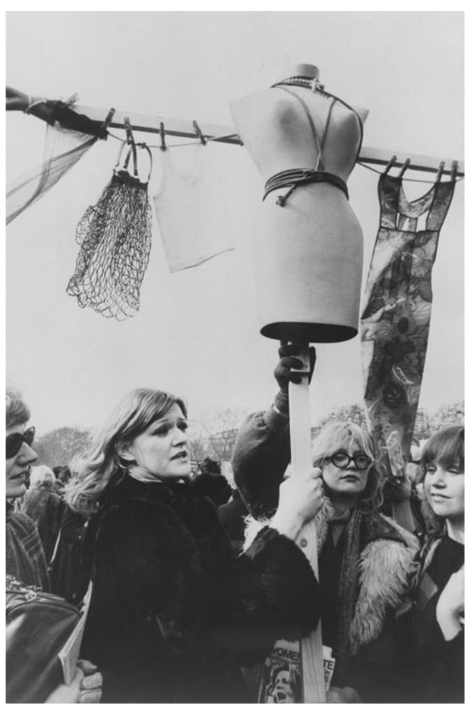
14. Women's Liberation groups marching through London, 1971.