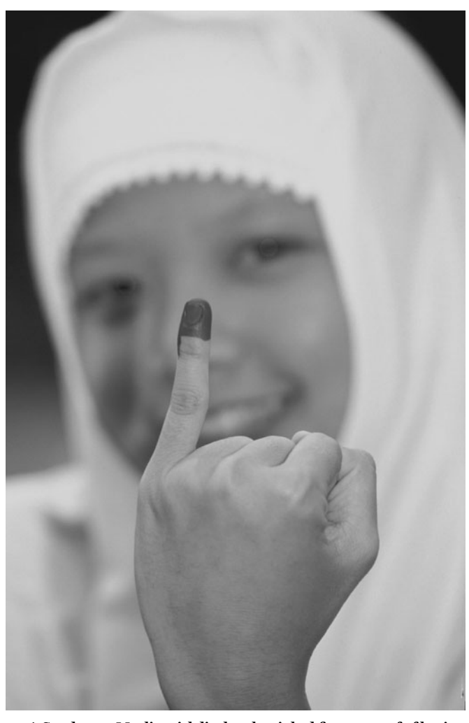
18. A Sundanese Muslim girl displays her inked finger, proof of having voted. Sundanese women were enfranchised in 1964.