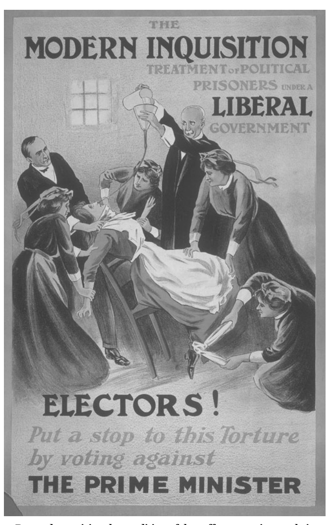
9. Poster dramatizing the condition of the suffragette prisoners being force-fed, 1910.