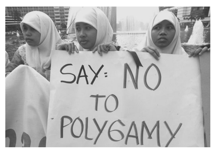
19. Protest by a women's rights group in Jakarta, November 2000.

to define a specifically Islamic feminism, one that is rooted in local cultures and traditions that, they argue, have always treated women with respect. They have maintained their position in the face of considerable, and perhaps growing, opposition.