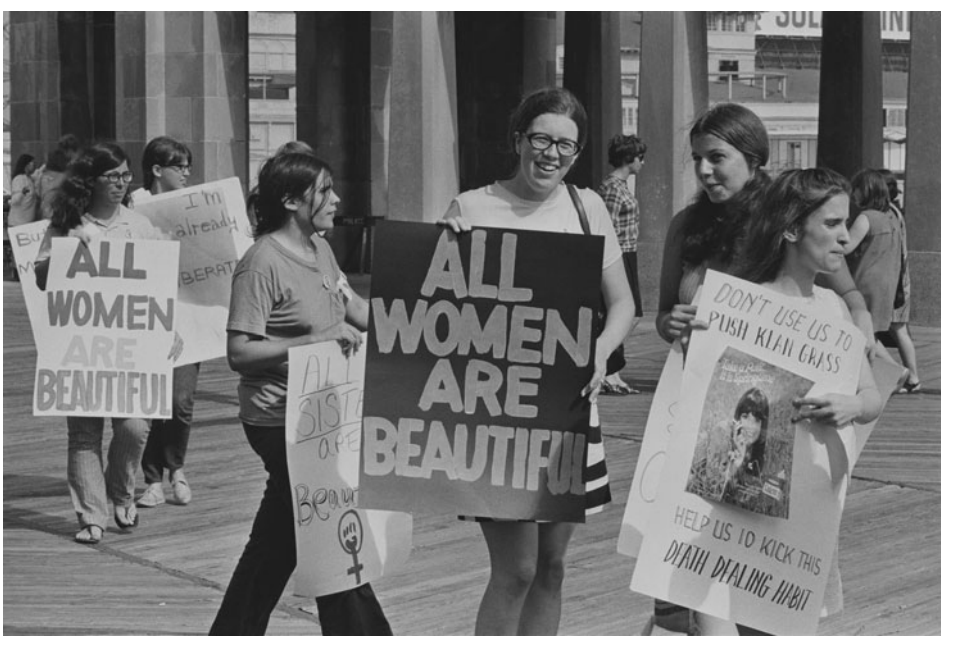
13. All women are beautiful: demonstration against the Miss America pageant, Atlantic City, 1969.