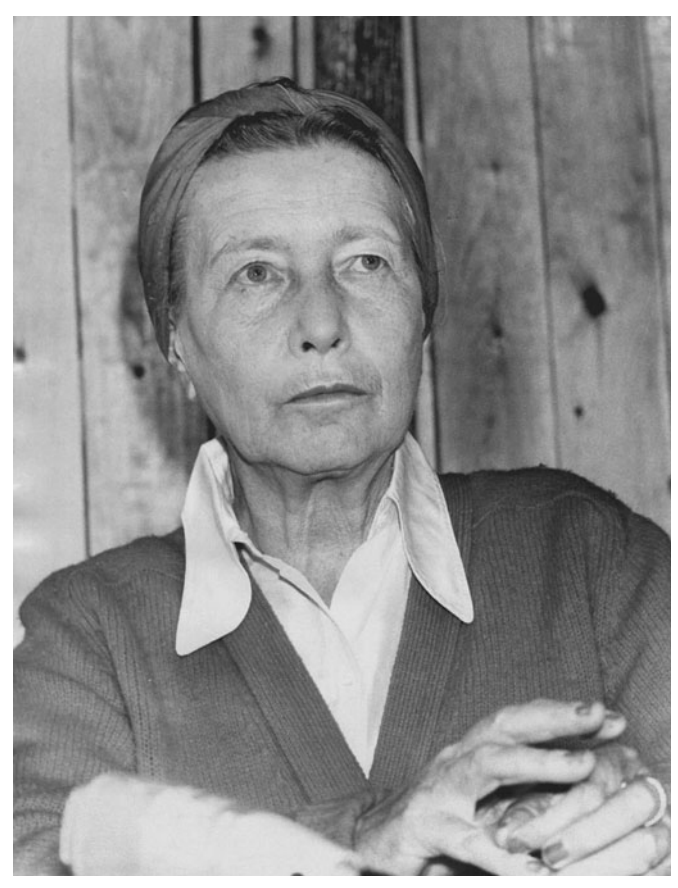
11. Perhaps the most influential of all 20th-century Western feminists, Simone de Beauvoir remains important still, for her autobiographies and novels as well as for her great piece of feminist theory, The Second Sex .

masculine world, and as a woman . . . I was encouraged to write The Second Sex precisely because of this privileged position. It allowed me to express myself in all serenity.