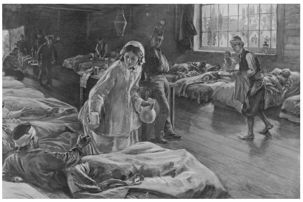
4. Florence Nightingale was a national heroine – the 'Lady with the Lamp' – often, as here, celebrated for her compassion and womanly tenderness towards the wounded soldiers in the Crimea, rather than for her truly remarkable talent for administration and organization.